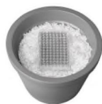
Plate directly on crushed ice does not reach 4°C in any of the wells and well-to-well temperature is uneven.

SOLUTION: UNIFORM PLATE COOLING WITH COOLSINK® XT 96F MODULE