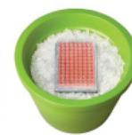
Plate placed on CoolSink module and then placed on ice shows more uniform well-to-well temperature and all wells at or below 4°C (Blue center plate wells are slightly warmer due to curvature of the underside of the plate.) Published in Biotechniques, November 2010.