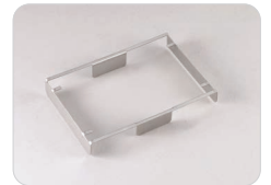
59-2009 Sealing Frame