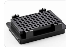
59-2005 Plate Support Adapter, Random Access, Low Profile