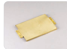
59-2008 Weighted Sealing Platen