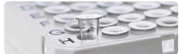
Random Access 96 Well Skirted PCR Plate sealed with Random Access Pierce Heat Seal Strong

N.B. We are in the process of developing additional Random Access seals as well as cap mats to meet our customers' varied application needs.