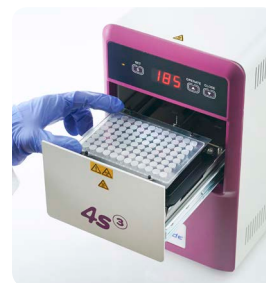
Random Access Sealing using the 4s3™ Heat Sealer