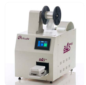
a4S RA Automatic Random Access Heat Sealer