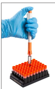
Automated Storage Systems