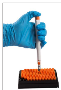
Cryopreservation & Cold Chain Solutions